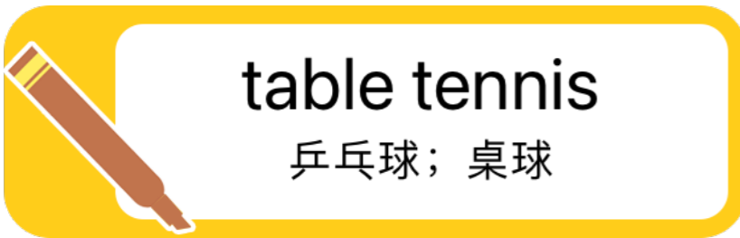
table tennis table tennis